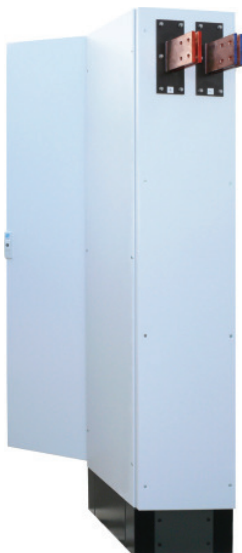
POWER STATION pe5410-W, back view

EMV: EN50011 class A, group B ; EN61000-6-4 and EN61000-6-2; CE-conformity low voltage guide line: EN50178