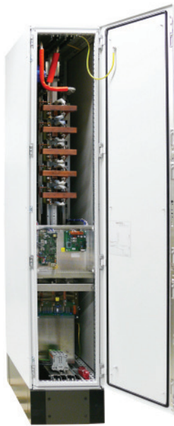
POWER STATION pe5410-W, front view

Water cooled DC power supply in switch mode technology, designed for the direct installation at the electroplating tank with minimal space requirement.